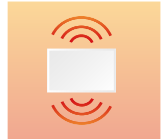
Invo's Infrared Panels